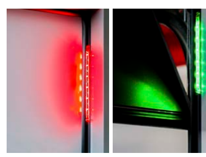
Lumi Strip traffic light

Date: 04/2018. Subject to misprints, errors and technical changes.